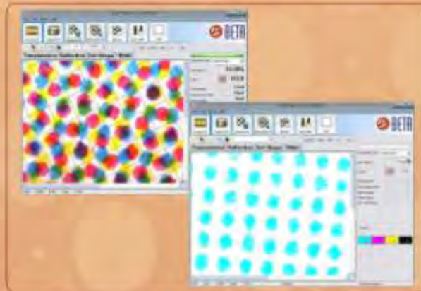
Image Color Separation & Analysis from printed halftones, separated and analyzed for true halftone dot area analysis & correction. Useful for printing without targets.

function auto-matically rotates, scales, and overlays images to display and measure differences in dot area. See dot size change from mask to plate to print, plant to plant, or week to week. See changes in the process or materials, the plant or the method before expensive errors propagate through the system.