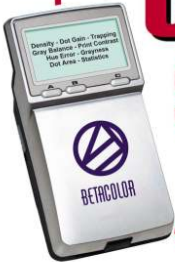
BETACOLOR S-SERIES DENSITOMETERS