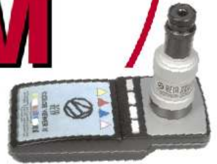
BETA COLOR VIEWER